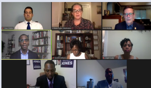
Candidates ready to go for the digital forum. (Not pictured but joined by phone is candidate Dennis Kucinich.)

On August 11, Lutheran Metropolitan Ministry (LMM), in partnership with nine other housing and homeless services providers, Homeless Congress, and the League of Women Voters of Greater Cleveland hosted a Mayoral Forum on Housing and Homelessness. The forum was developed to ensure issues of homelessness and housing instability are center to the candidates' platforms and that their vision for ending homelessness communicated to a broad audience.