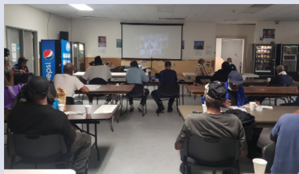
Men's Shelter residents watch and discuss the Forum